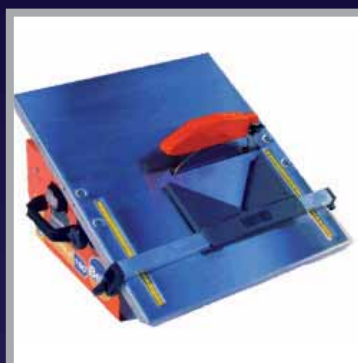
Tilting Table For 45° Cuts