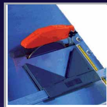
Sliding Mitre Tool