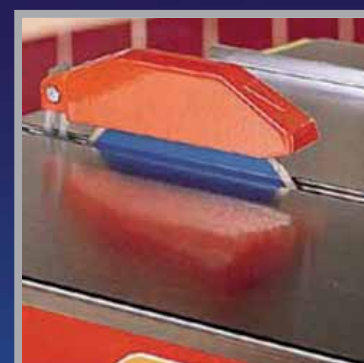
Diamond Blade For Fast Cuts And Durability