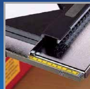
Side Fence For Identical Cuts

A range of Belle Diamond Blades available